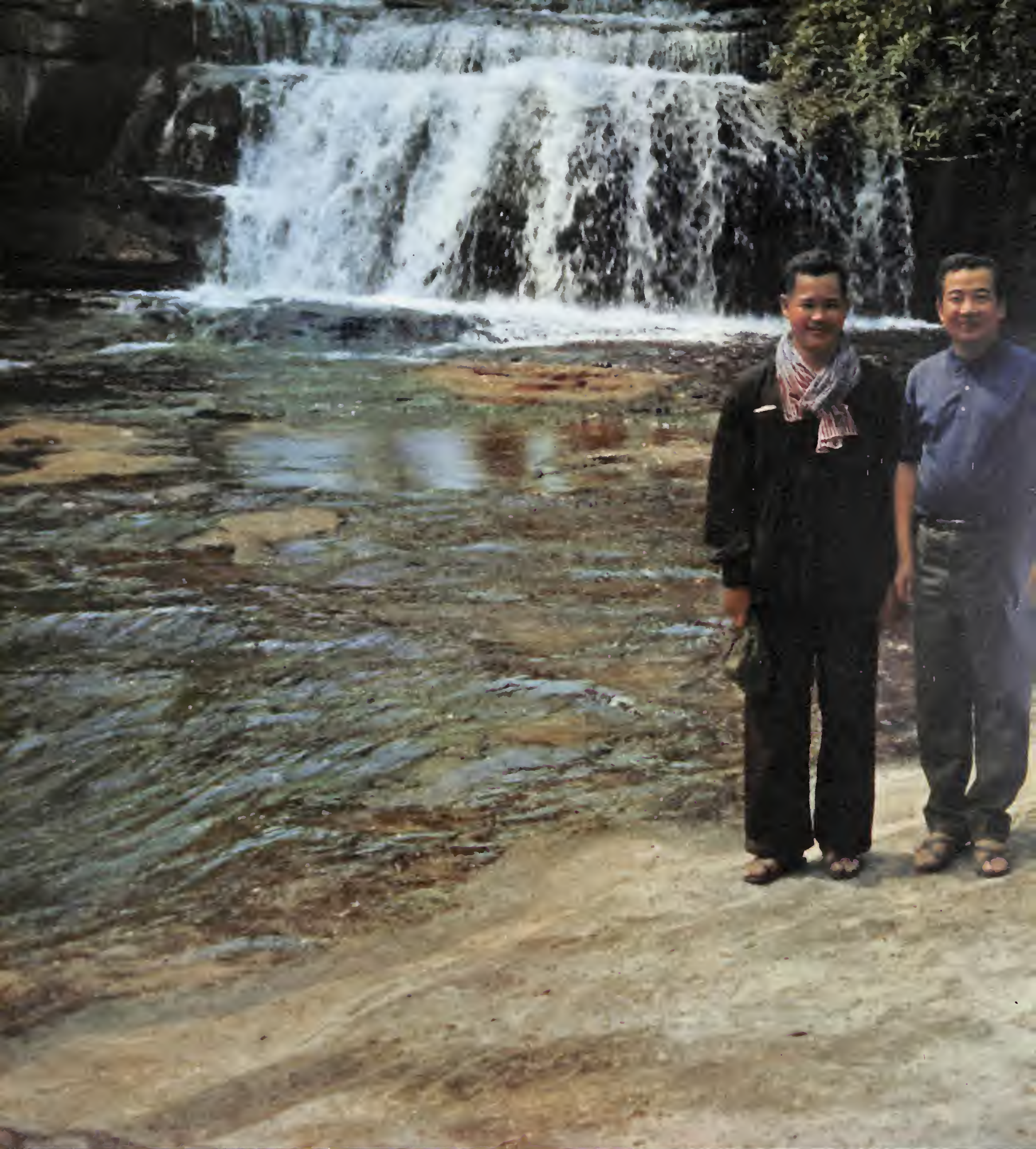
Close ties between the Head of State and leaders in the interior.